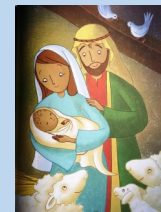
Jesus is Born

Until we return to having chapels inside the church building, I am unable to show videos to the kids. Below is the video we would have watched today. They are on YouTube so you can let your children watch them at your convenience, and as often as they like!